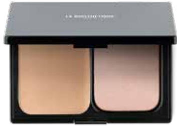
EXTREME STAY FOUNDATION