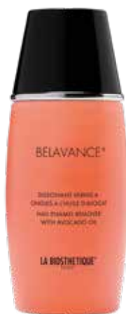
NAIL ENAMEL REMOVER