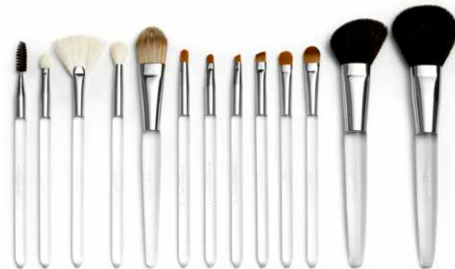
PINSELSET MAKE-UP SCHWAMM 2-FACH SPITZER KABUKI PINSEL NAGELPOLIERFEILE SCHMINKTÄSCHCHEN TRAGETASCHE